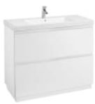
Unik (base unit and basin)