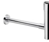
1 1/4" outlet connector for basin. 300 Pipe